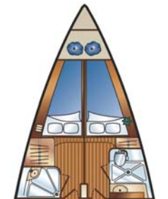
Four Stateroom Option