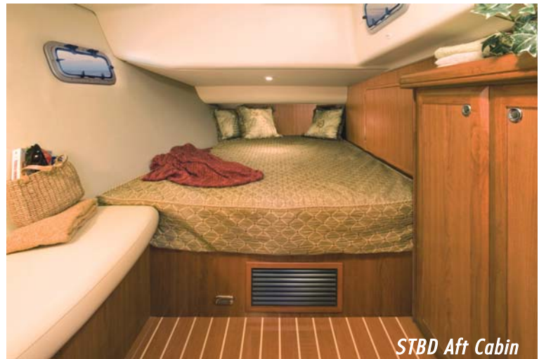
STBD Aft Cabin