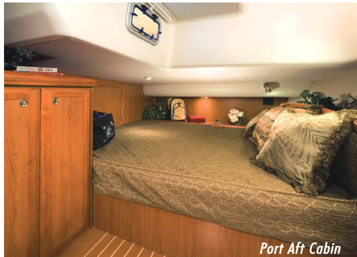
Port Aft Cabin